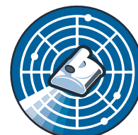
CleaverClean scanning system